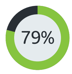
of employees always or frequently work as part of a virtual team.